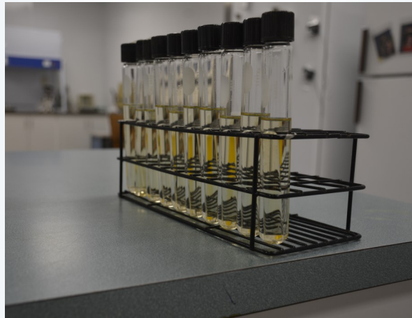
Total MPN analysis for Coliform

Fox Valley Quality Control Lab is certified by the Wisconsin Department of Natural Resources (WDNR), Wisconsin Department of Agricultural Trade & Consumer Protection (WDATCP) & Environmental Protection