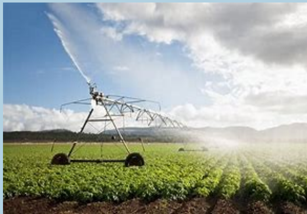
Irrigation of produce

Agricultural water has been identified as one probable route of produce contamination with pathogens that can cause human illness. As a result, new testing requirements have been put in place for certain water used in agriculture. The rule currently requires agricultural water from wells to be tested along with surface waters used in agricultural production. In addition to these water sources, other on farm water sources will require presence/absence testing for generic E. coli.