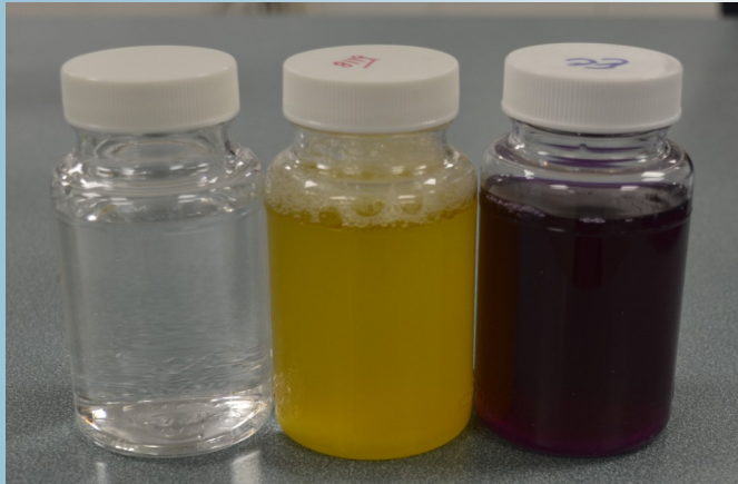
Colisure Safe drinking water analysis

While most private wells provide safe and clean drinking water, this may not always be the case. Your water can become contaminated by bacteria and other impurities that are not filtered out when water seeps through the soil. These impurities can get into your water through cracks in your well wall, weakened seals, or fractures in underlying bedrock. Many times, we are not able to see, smell or even taste contaminants that may be lurking in our water. Over time, these contaminants can cause illness and other health issues. It's recommended that your well water is tested annually to ensure safe and clean water is available for you and your family.